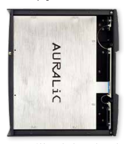
ABOVE: Hidden under the top-plate and screening the digital electronics within is a separate nickel-plated copper enclosure

The Aries G2.2 brought out the two DACs' respective characters: detailed and crisp for Musical Fidelity's model, transparent and exact for T+A's. The percussion in the lively background on 'Little Margaret', for example, was a shade more expansive and natural via the DAC200. Determining differences between D/A converters is always challenging, but I felt the Aries G2.2 was aiding the investigative process, not muddying the waters.